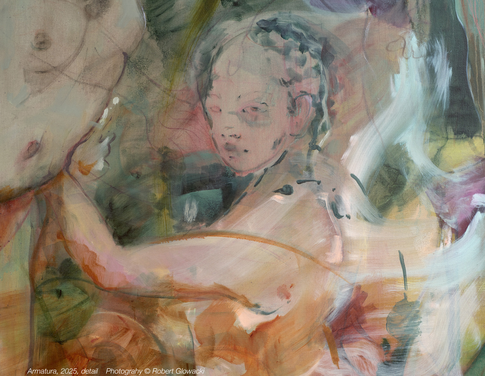
Armatura, 2025, detail